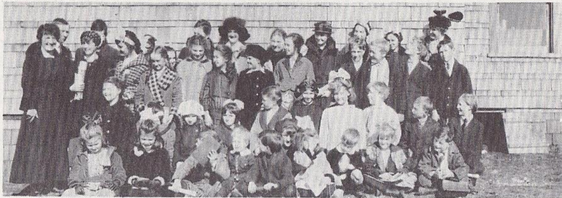
SUNDAY SCHOOL OF THE FIRST CONGREGATIONAL CHURCH OF AMERICAN LAKE, ABOUT 1915